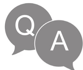
Question/Answer with Audience 11.20am - 11.30am