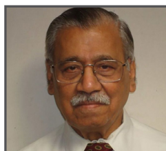
Justice Ahmadi - Former Chief Justice of India Introduction of the Syedna Qutbuddin Harmony Prize 10.55am - 11.00am