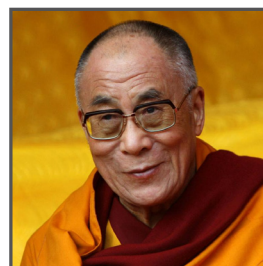
His Holiness The Dalai Lama 11.00am - 11.20am