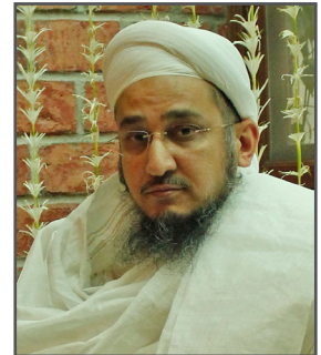
His Holiness Syedna Taher Fakhruddin Saheb