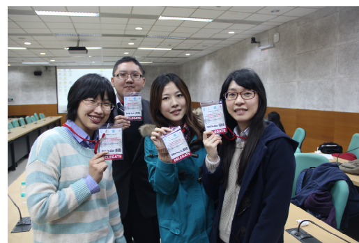
Student delegates from Taiwan

presented: eight by Taiwanese students, two by Indian students studying in Taiwan, and seven by Indian students.