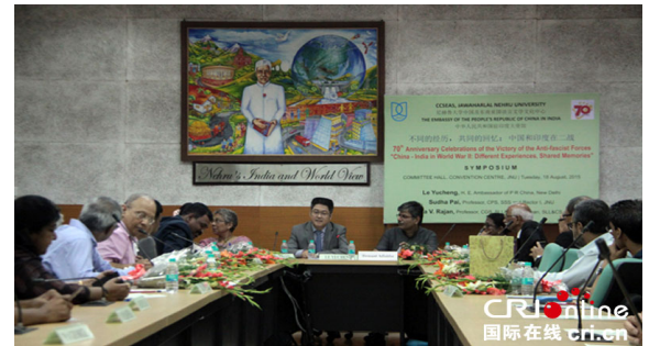
Aglimpse of the proceedings of the conference

Committee, India-China Friendship Association, and overseas Chinese Association in Kolkata.