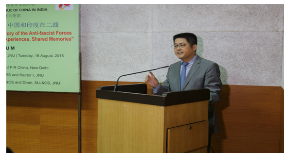
Ambassador Le Yucheng delivering the Keynote Address

Ambassador Le Yucheng remarked in his keynote address that 'the Chinese people will not forget the strong political support that India rendered to China since the beginning of Japan's aggression in the 1930s. He said China will not forget how Mahatma Gandhi gave his moral support as he said "my heart goes to the people of China in deep sympathy and in admiration for their heroic struggle and endless sacrifice in the cause of their country's freedom and integrity against tremendous odds", and how Rabindranath Tagore supported the Chinese people's liberation cause with the power of his pen. It is worth recalling that when the war broke out in Europe in September 1939, Jawaharlal Nehru was in China, where he not only met the Chinese leadership but also experienced Japanese bombing raid.'