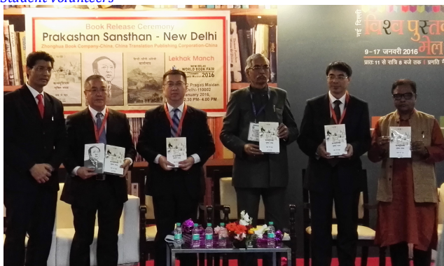
CPG vice Chairman, Director Zhonghua Books and NBT Chairman releasing the Hindi translation of the Analects of Confucius

One of the attraction to which both China and the NBT had attached great importance was the first ever