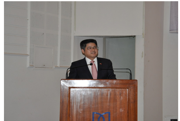
H.E. Mr. Le Yucheng making remarks at the opening ceremony

CCSEAS also honed their skills in demonstrating the characters by body movements.