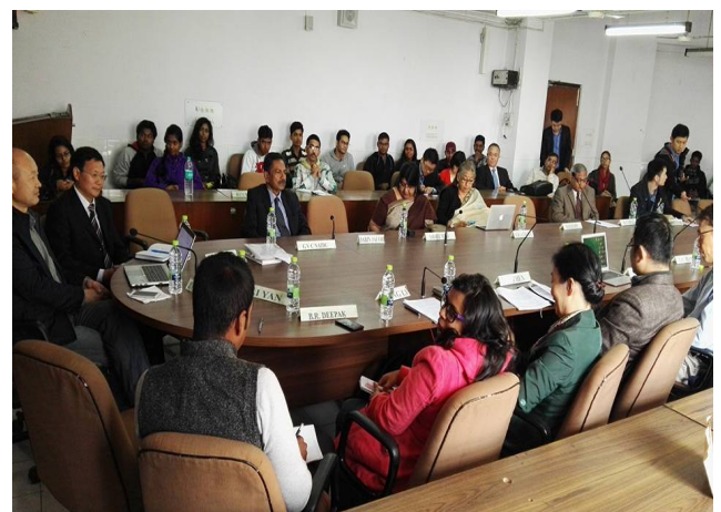
The proceedings of the India-China Academic Forum